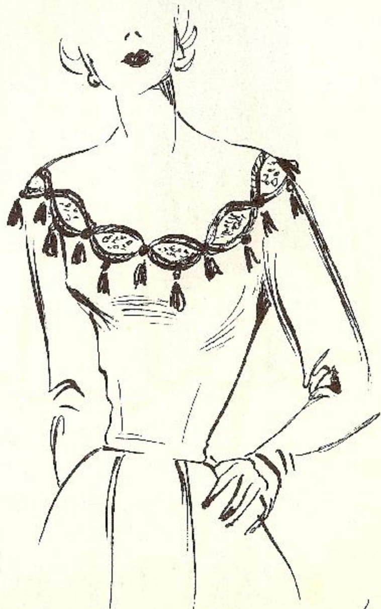
Bird + Bird Embroidery