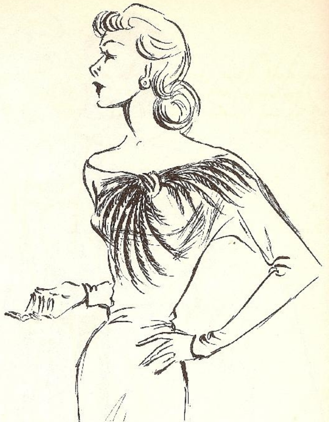
Embroidered to resemble "Bird of Paradise"